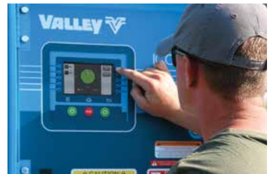
Intuitive soft touch buttons