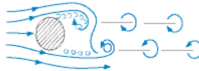
Vortex formation in the wake of a bluff object

the natural frequencies of the structure, the amplitude of displacement increases, potentially resulting in high bending stresses in the supporting structure. This interaction is often repetitive over a short time period, creating a high quantity of stress cycles during each wind event.