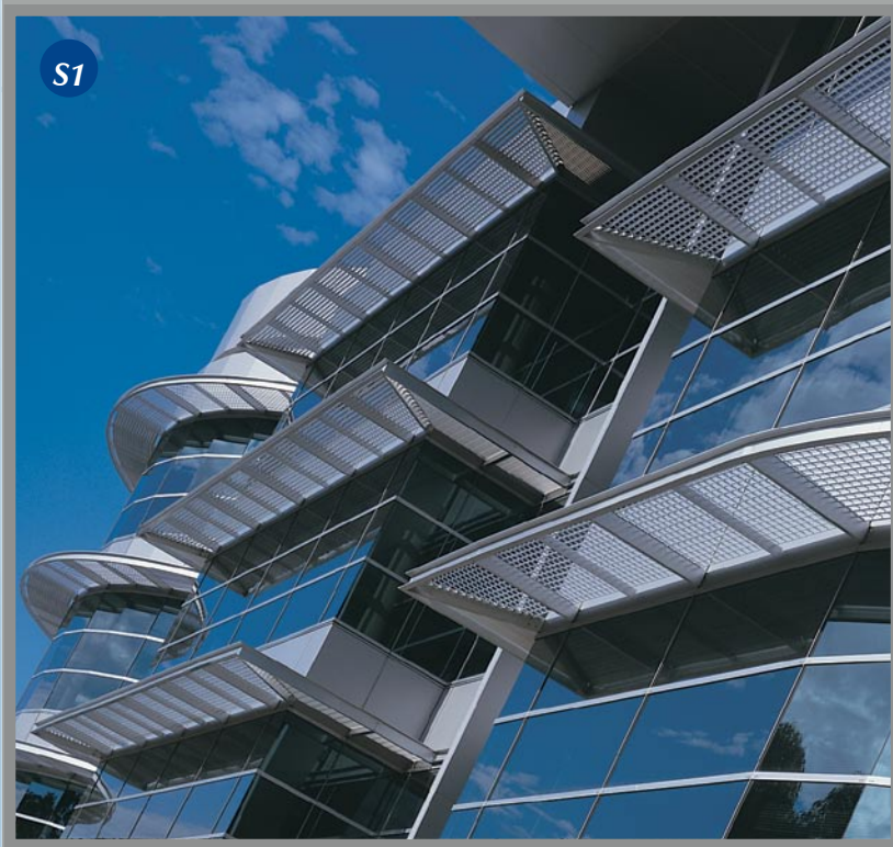
Victoria Gardens, Richmond, Vic, SS203/80 non-trafficable louvre set within aluminium RHS and channel support frame.