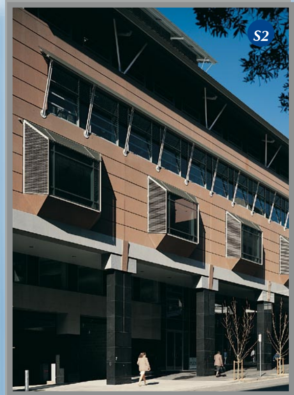
U.T.S. Faculty of Architecture, Ultimo, NSW SS203/43 louvre set in SHS hinged framing to bay windows. SS203/60 -louvres on the second floor.