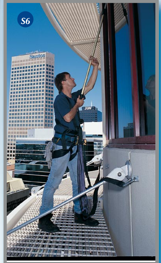
Australian Tax Office Adelaide, SA, sunshade louvre type SC323/60 supported by structural suspended perimeter framing, incorporating safety-line attachment points.