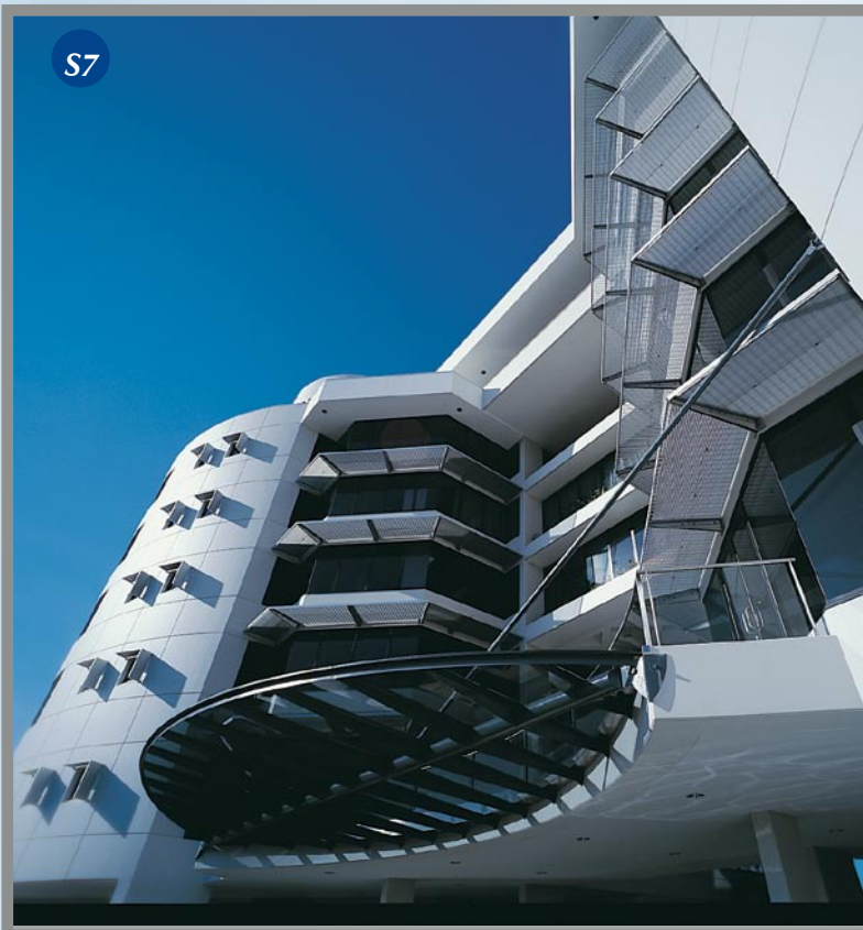
Kings Row, Milton, Qld, HA653 grating, DAN019 cantilevered aluminium angle support framing. Safety-line system utilising cast-in stainless eyelets.