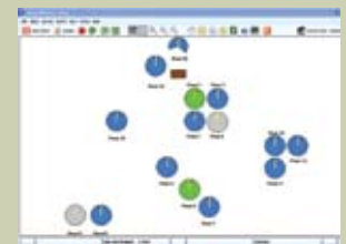
Maas BaseStation Map

Maas says BaseStation has helped him conserve energy and irrigation water. "Soon, the amount of water will be allocated due to regulatory restrictions," Maas says. "Which makes it even more important to shut off your sprinkler quickly when you have a good rain."