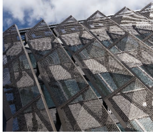
* Typical architectural facade installation of a perforated metal panel with varying hole sizes.