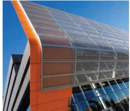
* Typical architectural facade installation of a perforated metal panel.