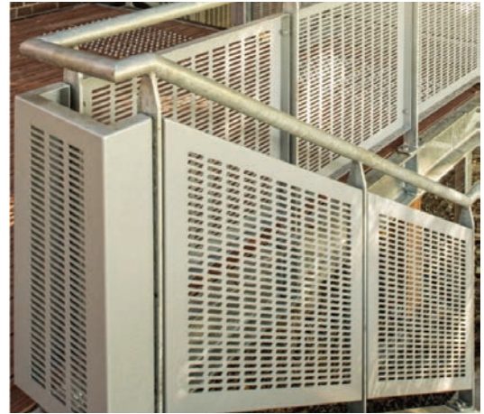
* Typical architectural facade installation of a perforated metal panel.