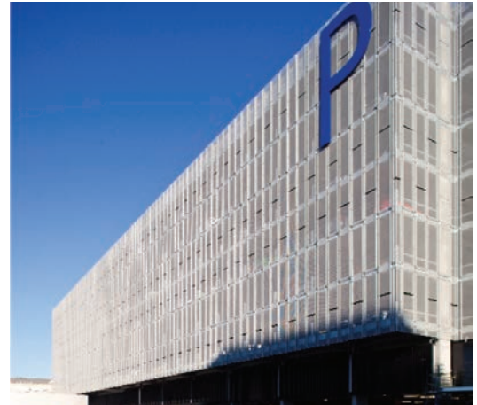
* Typical Architectural Facade Installation