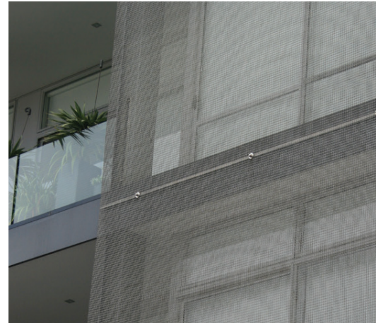
* Typical Architectural Facade Installation