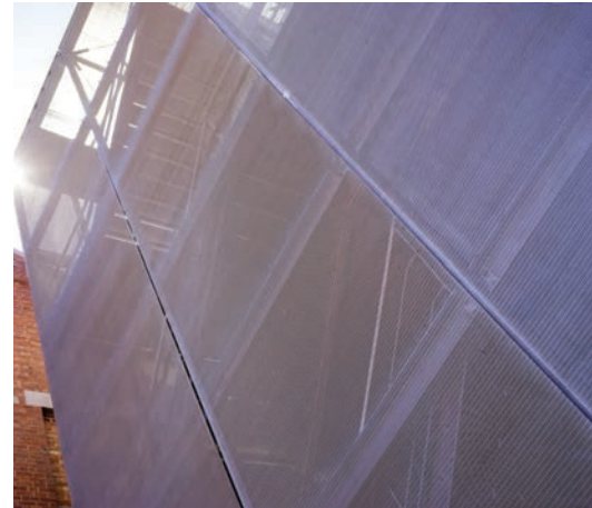
* Typical Architectural Facade Installation